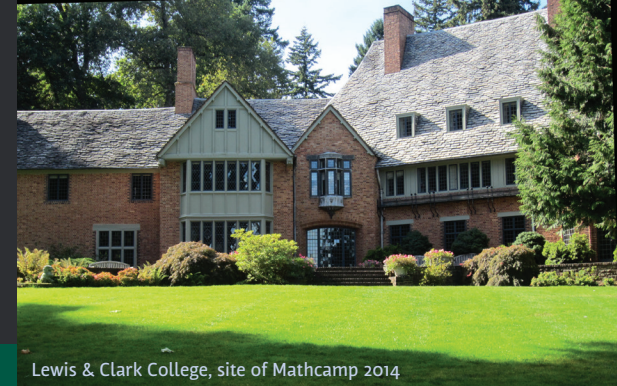
Lewis & Clark College, site of Mathcamp 2014

July 6 - August 10, 2014 Lewis & Clark College, Portland, OR